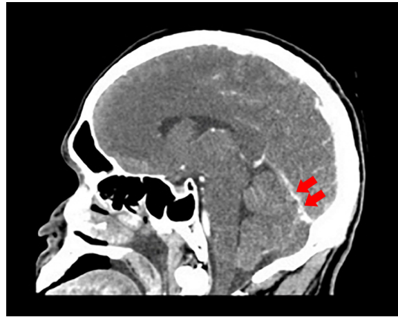
Figure 2: Computed tomography of the brain with contrast revealed a straight sinus with irregular caliber (red arrows).

(WBC count of 7631 \times 10^6/L (normal range = 0-5 \times 10^6/L ), red blood cell count of 4000 \times 10^6/L , protein level of 5968 \text{ mg/L} (range = 150-450 \text{ mg/L} ), and glucose of 0.42 \text{ mmol/L} (normal range = 2.22-3.89 \text{ mmol/L} )). The culture of cerebrospinal fluid revealed gram-negative diplococcus, which was confirmed to be N. meningitidis (A/Y antigen by latex agglutination assay). Other blood work showed elevated levels of fibrinogen at 11.2 \text{ g/L} (normal range = 1.9-4.3 \text{ g/L} ), D-dimer of 1.1 \text{ } \mu\text{g/mL} (normal \leq 0.5 \text{ } \mu\text{g/mL} ), blood creatinine levels of 171 \text{ } \mu\text{mol/L} (normal range = 50-104 \text{ } \mu\text{mol/L} ), urea of 9.7 \text{ mmol/L} (normal \leq 8.3 \text{ mmol/L} ), and total and direct bilirubin levels of 22.3 \text{ } \mu\text{mol/L} (normal \leq 21 \text{ } \mu\text{mol/L} ) and 19.1 \text{ } \mu\text{mol/L} (normal \leq 5 \text{ } \mu\text{mol/L} ), respectively. Total protein and albumin were both decreased at 56 \text{ g/L} (normal range = 64-83 \text{ g/L} ) and 25 \text{ g/L} (normal range = 35-52 \text{ g/L} ), respectively.